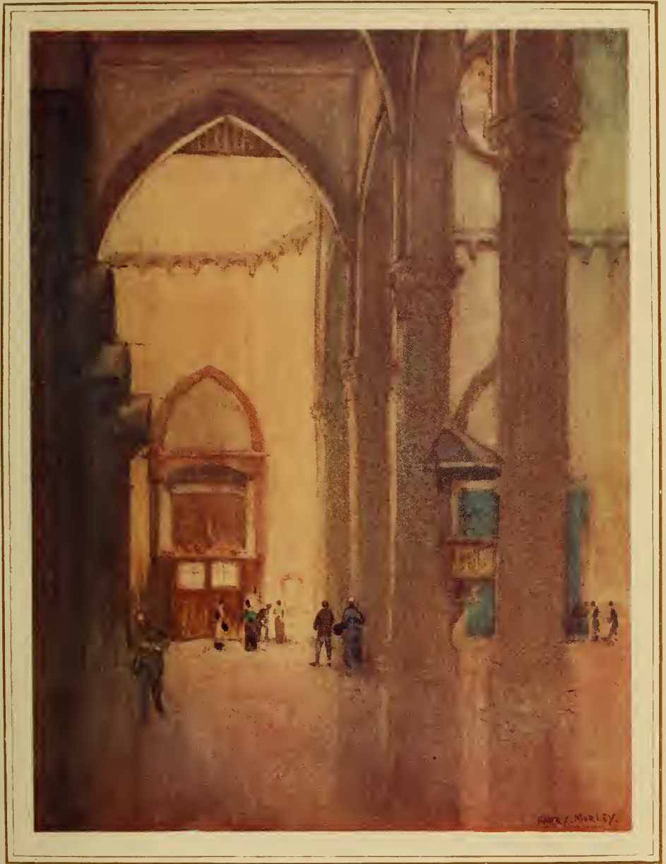
INTERIOR OF S CROCE